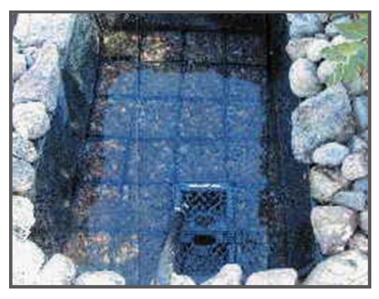
Figure 1: Typical anoxic pond without plants \sim continued on page 8 \rightarrow

Figure 1 shows a <u>typical anoxic filtration pond</u> without the plants. It's a simple shallow pond, around 24" deep, with water being pumped into one end and overflowing by gravity back into the main pond at the other end. This anoxic pond contains 22 biocenosis baskets . Small pebbles on top of the baskets prevent the cat litter inside from being disturbed by the water flowing past them, which would cause it to float away.