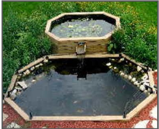
Figure 2: Entire filter system hidden in plain sight. The top pond is actually the anoxic

Figure 2 shows how the entire anoxic filtration system can be "hidden in plain sight." The anoxic pond <u>looks</u> <u>like a water garden, not a filter</u>, and yet everything except the pump in the main pond can be clearly seen. For those who don't like pump-fed systems, the anoxic pond can be gravity-fed from a bottom drain. Build it at the same level as a conventional gravity-fed system and use a submersible pump or external drymounted pump to move water from the anoxic pond back into the main pond. Your ingenuity is the only limit to how the system is built or adapted.