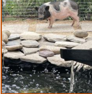
If anyone is interested in having a pig, Cricket will let them go for the price of their surgery, $120 for the males (2) or $150 for the female, certificate included.

We look forward to seeing more of you this month and having a good time at the Mouws'. Remember yur chairs, something for the buffet table, and make sure you sign up for the Thanksgiving Feast in November.