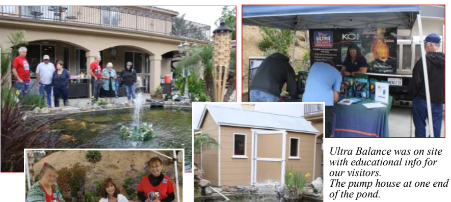
Ultra Balance was on site

Visitors to the Henry's pond readily recognized the family fun and entertainment focus of the backyard, but I heard the greatest